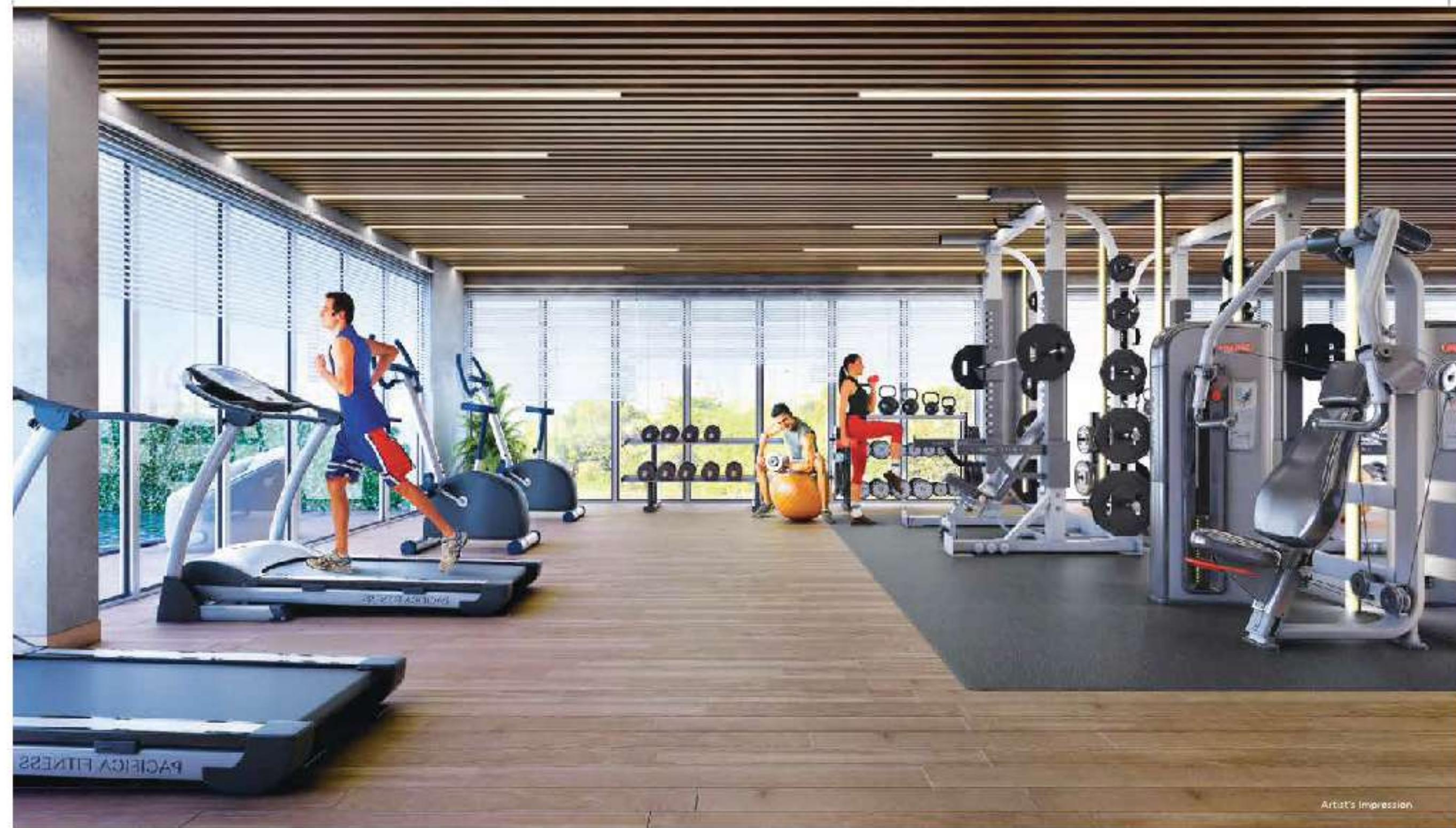
UNFORGETTABLE WORKOUTS AT THE MULTI-GYM