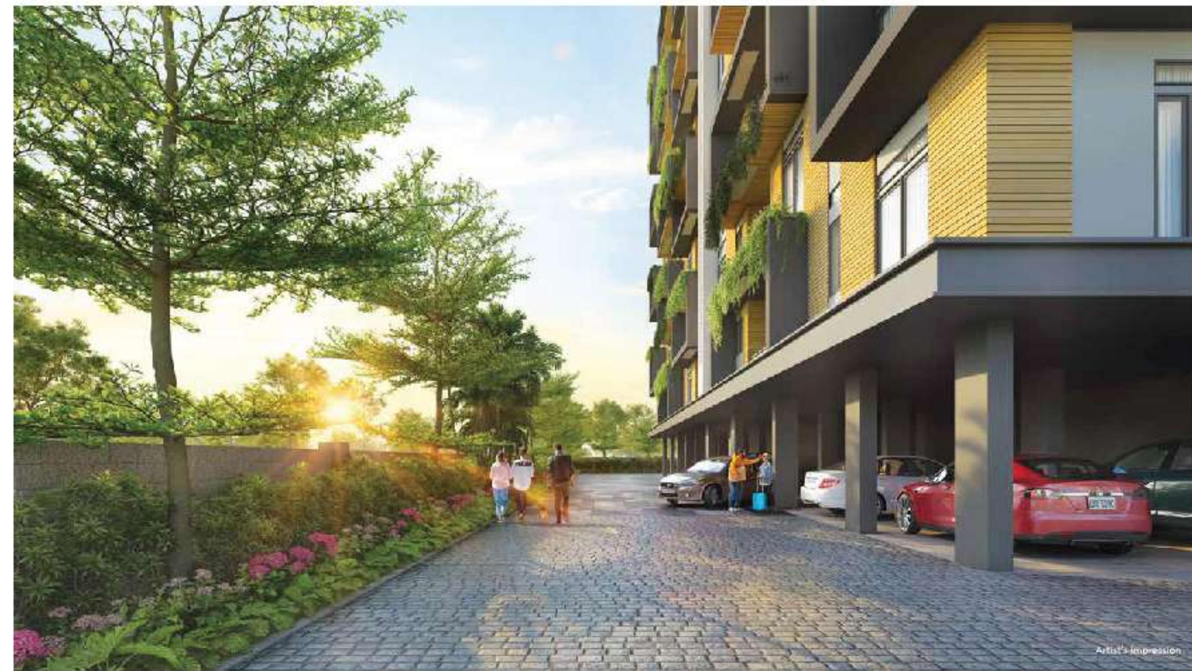
UNFORGETTABLY SPACIOUS BASEMENT & GROUND PARKING