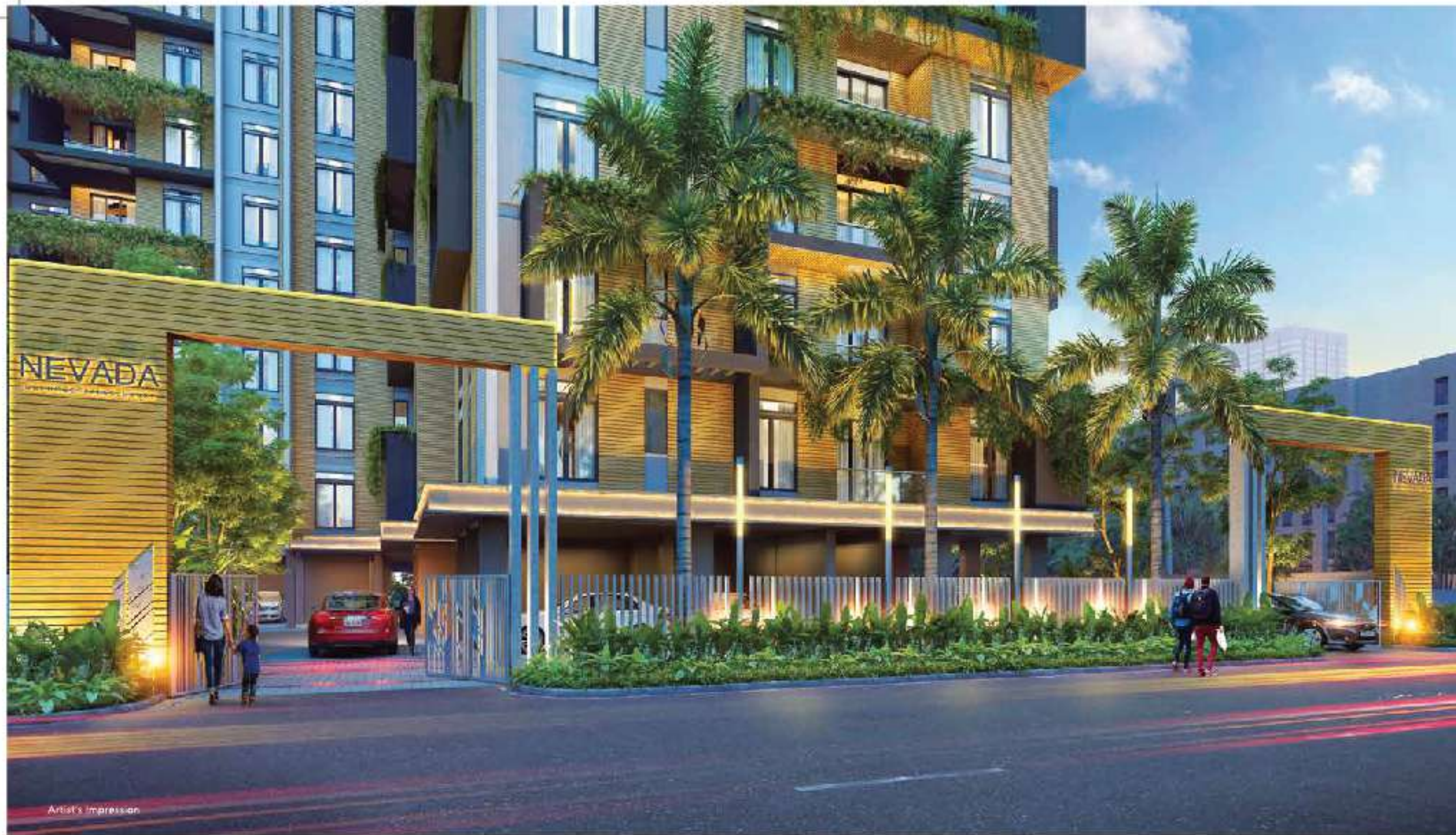
UNFORGETTABLY MASSIVE ENTRANCE