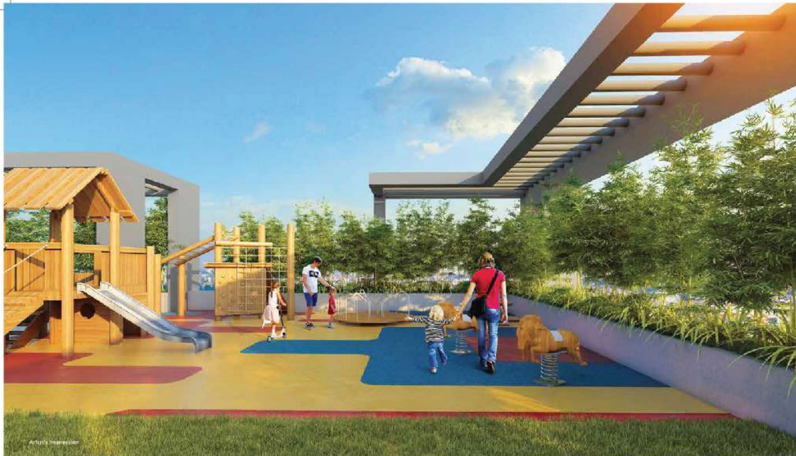
UNFORGETTABLY SPIRITED KIDS' PLAY AREA