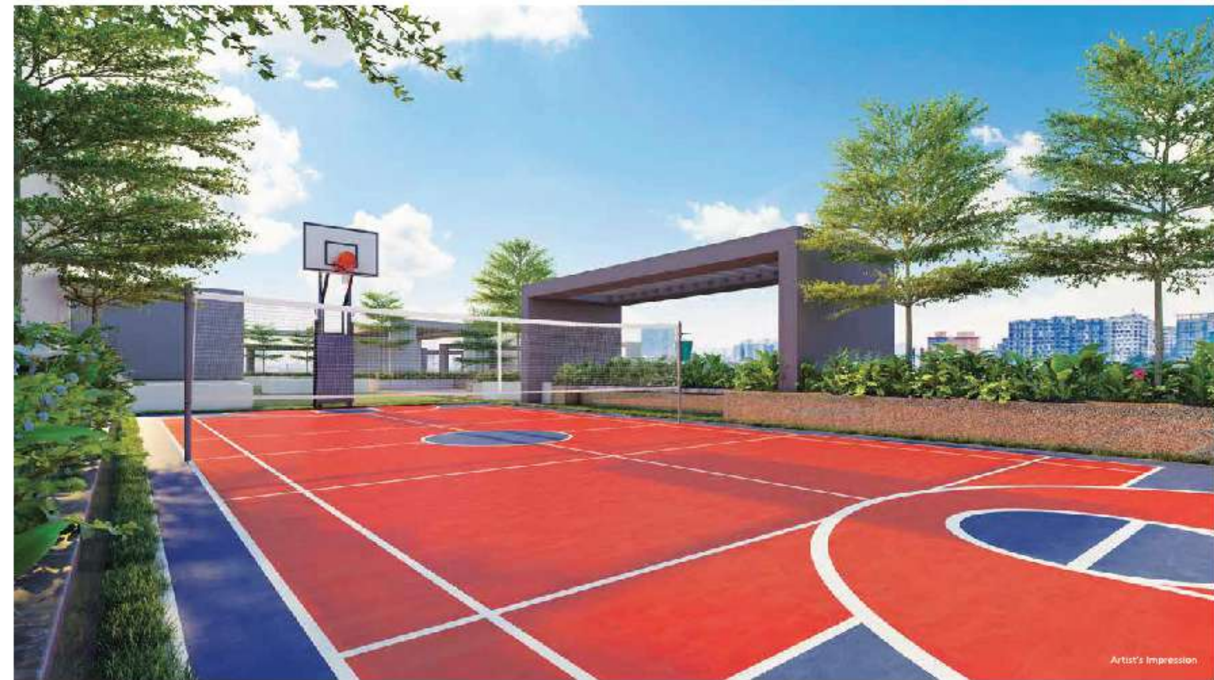
UNFORGETTABLY PLAYFUL ROOFTOP MULTIPURPOSE COURT